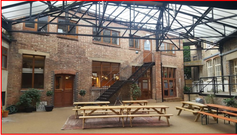
CENTRAL COURTYARD & CAFE